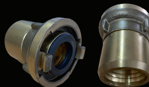
Brass Storz Coupling & Internal Expansion Coupling Set