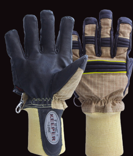
Askto Fire Keeper