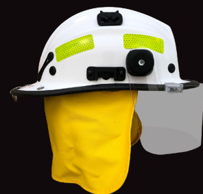
Pacific BR9 Wildland