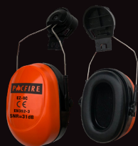
Fire Helmet Accessories and Replacements