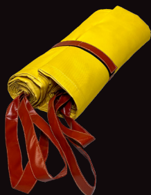
Bridgehill Training Car Blanket