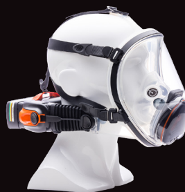
CleanSpace Ultra Full-Face Mask