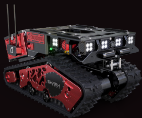
Shark Robotics Colossus