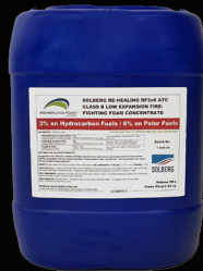
Solberg Re-Healing Class B