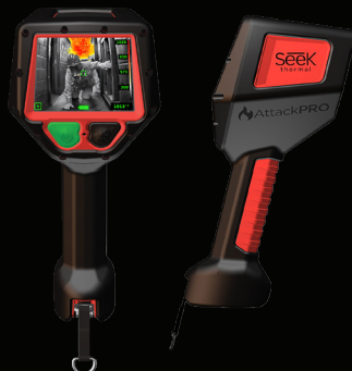
Seek Thermal AttackPRO