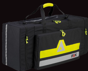
PAX Firefighter Kit Bag