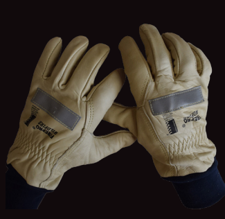
Firepro Wildfire Level 1