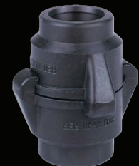
Red Head Forestry Wajax Coupling Set