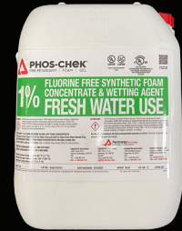
Phos-Chek 1% FF Class A/B