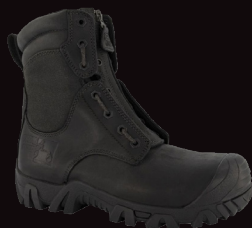
Magnum Vulcan Lite