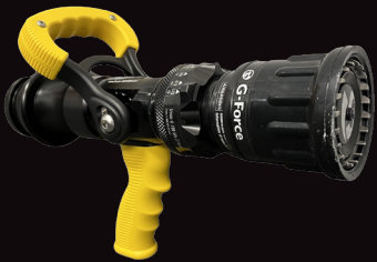
TFT G Force