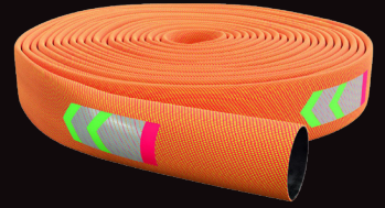
OSW Fire Safety