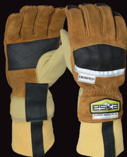
ESKA Supermars Plus Structural