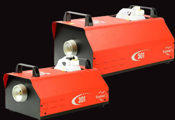
Trainer Smoke Machines