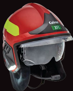
MSA Cairns XF1 Structural