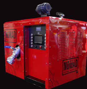
Nomad P5Xd Single Stage Diesel Fire Pump Module