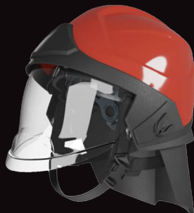
Pacific Haloflex F20 Structural