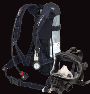
Scott Safety ProPak