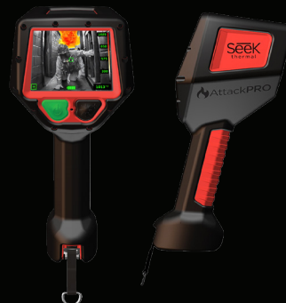
Seek Thermal AttackPRO VRS