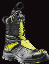
HAIX Fire Eagle Structural