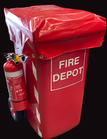
FRSA Fire Depot Kit