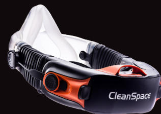
CleanSpace Ultra Half-Face Mask