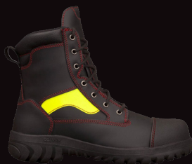
Oliver Wildland Lace-Up