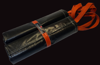
Bridgehill Car Standard