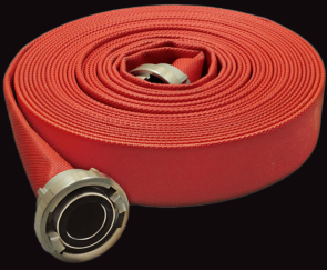
OSW Syntex Unidur