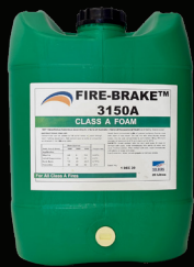
Solberg Fire-Brake Class A