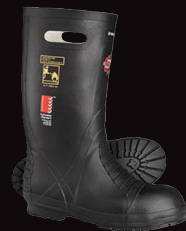
Skellerup Fire Fighter Extreme