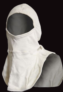
Stewart & Heaton Nomex Blend