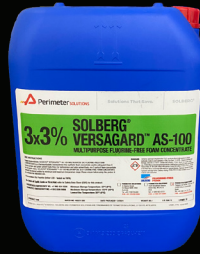
Solberg Versagard Class B