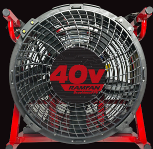
EX50Li DeWalt Milwaukee Makita