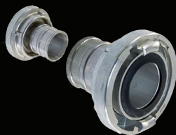
Alloy Storz Coupling Set