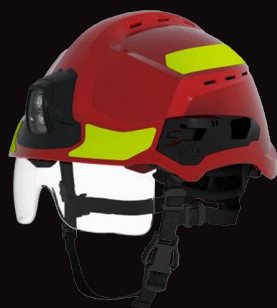
MSA Gallet F2XR