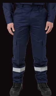
Stewart & Heaton T243 Wildand Trousers