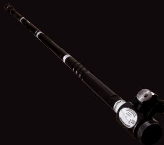
TFT EV Transformer Nozzle