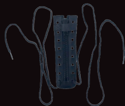
Fire Boot Shoelace Replacements