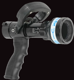
TFT Bubble Cup