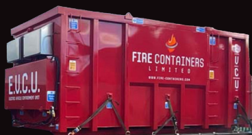
Electric Vehicle Containment Unit (E.V.C.U.)