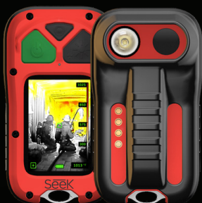
Seek Thermal FirePRO 300