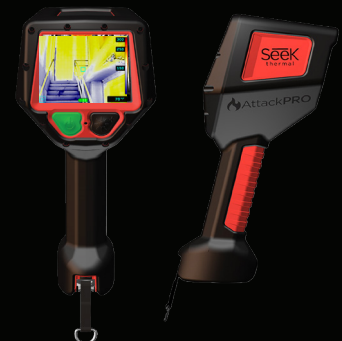
Seek Thermal AttackPRO NFPA