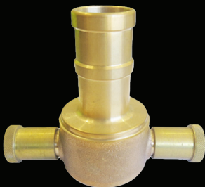
Brass and Alloy BIC Coupling Set