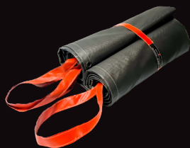
Bridgehill Car Pro X