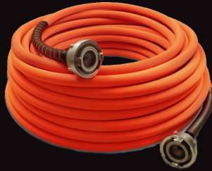
OSW Syntex Monoflex