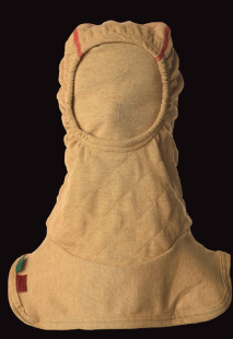
Bristol PBI Particulate Blocking