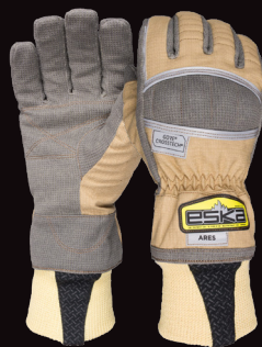
ESKA Ares Structural