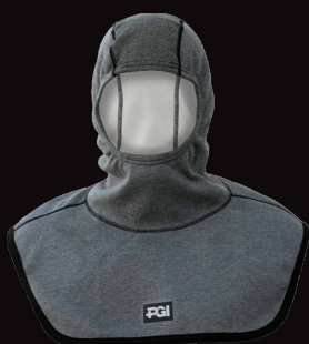
PGI BarriAire Silver