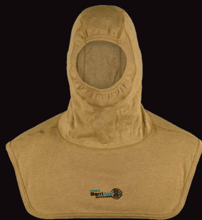
PGI BarriAire Gold